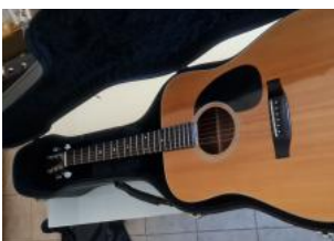
Takamine G330 lawsuit