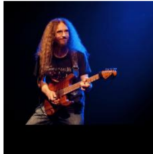
Interview with Guthrie Govan