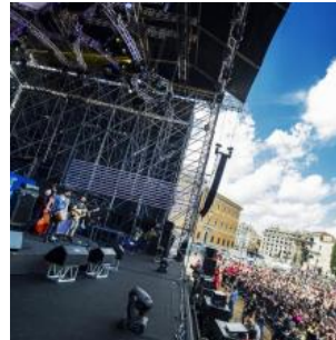
May Day concert: little attention to music.