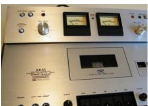
AKAY GXC 310 D