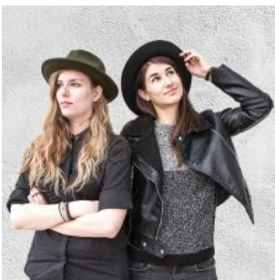
Seven tips for a smarter concert