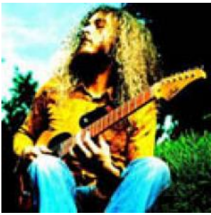
Interview with Guthrie Govan: "Don't be shy!"