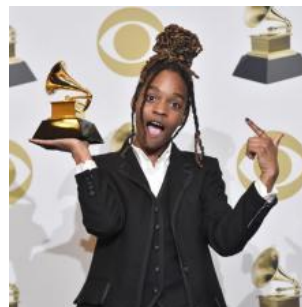
2020: the things I have heard and liked the most