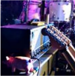
The instrumentation of the Aristocrats