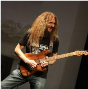
Interview with Guthrie Govan: "In Italy everything is beautiful, good and sounds good"