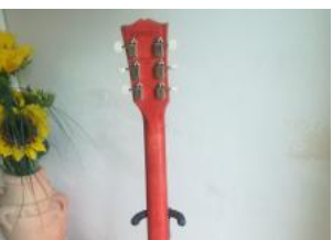
gibson les paul tribute